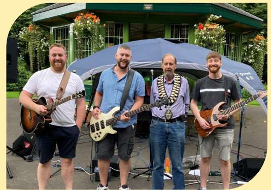
Pictured with local band, LickSquid

In May each year the Full Council elects one of the serving Town Councillors to take up the role of the Town Mayor and one to act as Deputy Mayor. In addition to responding to day to day issues raised by their local residents, the civic remit of Mayor is quite wide and varied. It includes Chairing the monthly Council meetings and being involved in Council Committees. The most visible role of the Mayor, however, is to be the public face of the Town Council at a variety of engagements.