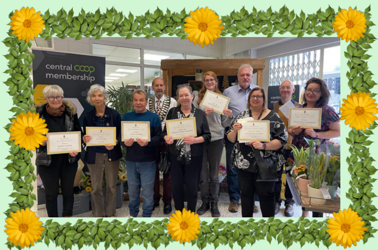
Winners and runners up receiving their prizes from the Mayor of Ripley, Councillor Paul Lobley BEM

Do you have a garden, allotment, school garden, community space or business floral display that you are proud of? If so, enter the 2024 competition - it's open to all Ripley Township residents! Details can be found below.