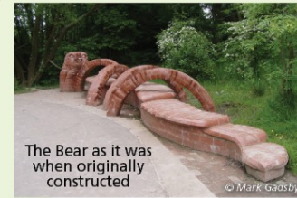
The Bear as it was when originally constructed

The remains of a brick sculpture, 'The Bear', built in 2000, can be seen here above the brook. The ideas of local school children were inscribed on some of the bricks.