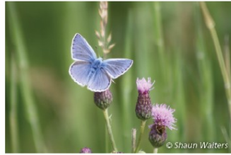
The Holly Blue butterfly needs holly, ivy and clover